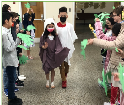
Our students in Levels 1, 2, IC-2 did a fine job of re-enacting Jesus' triumphant entry into Jerusalem on Palm Sunday!