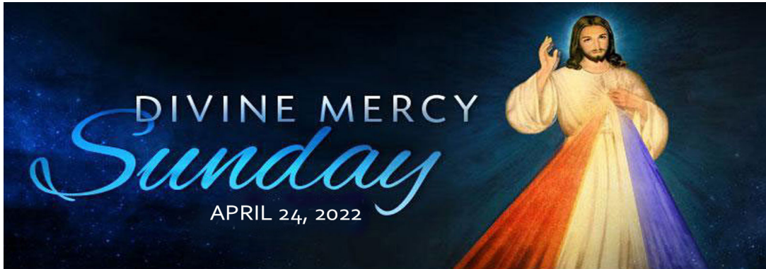
Our Spanish community celebrating Divine Mercy Sunday