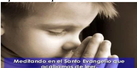
Meditando en el Santo Evangelio que acabamos de leer,