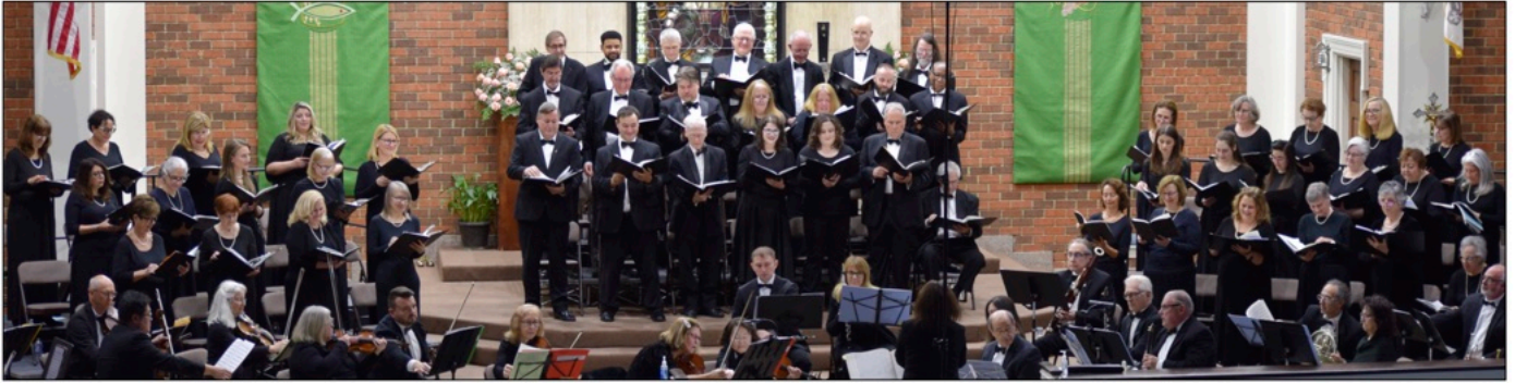
The Mineola Choral Society 2024 performance at Corpus Christi