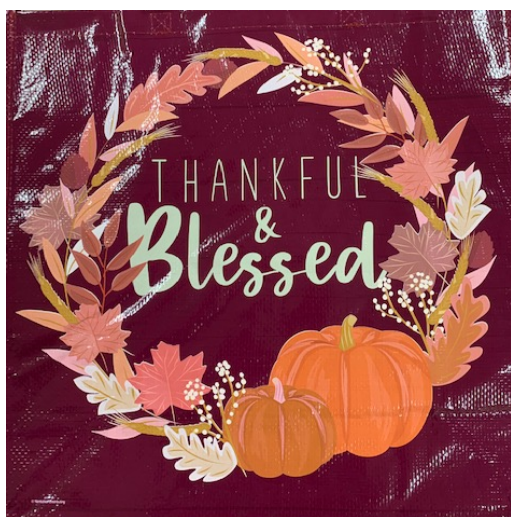
Actual Blessing Bag

Help BLESS our Parish Outreach guests' tables with your generous offerings.