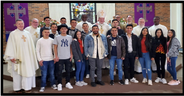
Spanish Youth Group attending Mass on Thanksgiving Day.