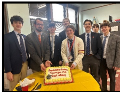
End of year celebration for our Chaminade teachers.