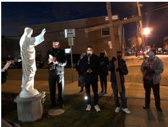
Good Friday outdoor Stations of the Cross