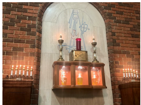
Holy Thursday Blessed Sacrament in Repose