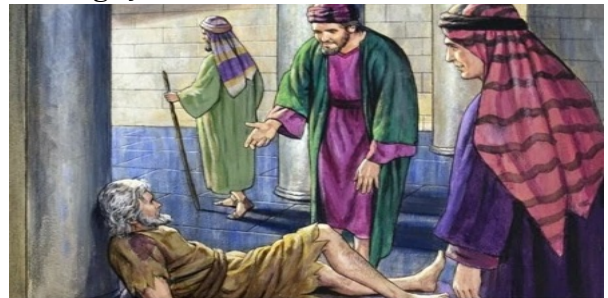
Pedro disse: "Prata e ouro não tenho, mas o que eu tenho eu te dou."

ovelhas. Em vez de apascentar as ovelhas, exploraram-nas, dispersaram-nas e mataram-nas. Por isso o Senhor promete ele próprio tomar conta do seu povo e enviar um verdadeiro pastor. Este governará com justiça e estabelecerá a paz. Jesus deu sua vida pelas ovelhas. A parábola do Bom Pastor não se dirige só àqueles que estão constituídos em autoridade na Igreja, mas também a todos os cristãos. Quem quiser ser discípulo de Cristo deve imitar a sua generosidade incondicional, não pode medir até onde chegam as suas obrigações.