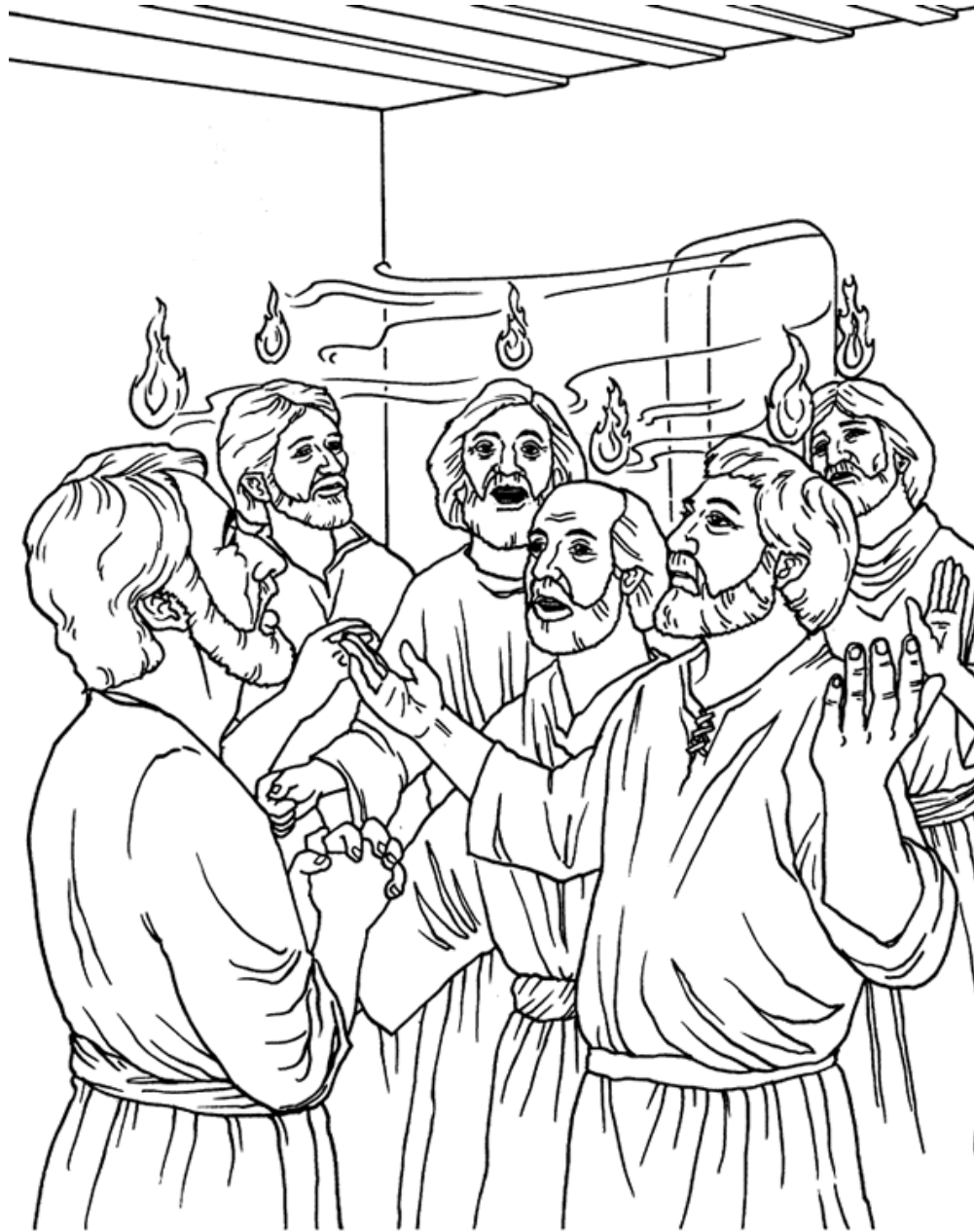
The Day of Pentecost Acts 2