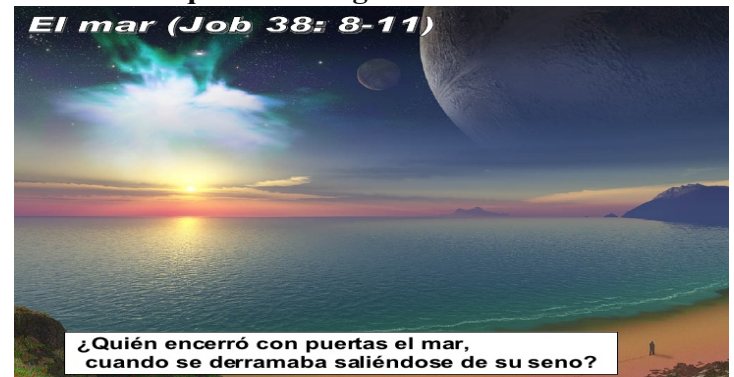
El mar (Job 38: 8-11)

las que habían visto de él, los discípulos ya deberían haber aprendido que la barca donde iba el Maestro no iba a hundirse. El Señor lo había dicho al comenzar la travesía: Pasemos al otro lado. Esto debió ser una garantía para ellos, pero el problema fue que se enfocaron en sus sentimientos y emociones en lugar de poner la palabra del Señor en práctica. Jesús sabe que estamos pasando por una tormenta. Jesús está con nosotros y por eso creemos que, tarde o temprano, vamos a llegar al otro lado al que nos está guiando.