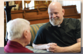
Supporting the needs of our senior priests in the Diocese of Rockville Centre.

The mission of St. Pius X Residence is to provide a nurturing environment that respects and cherishes the lifelong commitment of our beloved priests. The Residence strives to create a warm and supportive community where they can enjoy their retirement years with dignity, surrounded by like-minded individuals who share their dedication to faith.